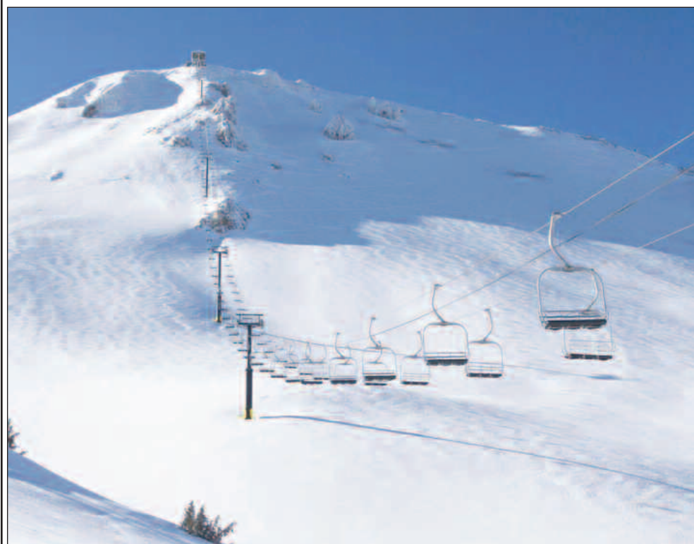
MAMMOTH LAKES, CA - Mammoth has deep powder and groomed runs for everyone. Winter 2023-24 saw more than 700 inches for a spectacular snow year. The resort kept skiing until August 6. There is every indication that this will be another very good year as well. Do not be left out, book early and often, and we will see you on Chair 23, shown here.

In 2015, Holiday Haus opened the "Casitas." They are perfect for a family trip. They have one king bed, pull out couch and full kitchen. They provide great space for family and friends at reasonable prices.