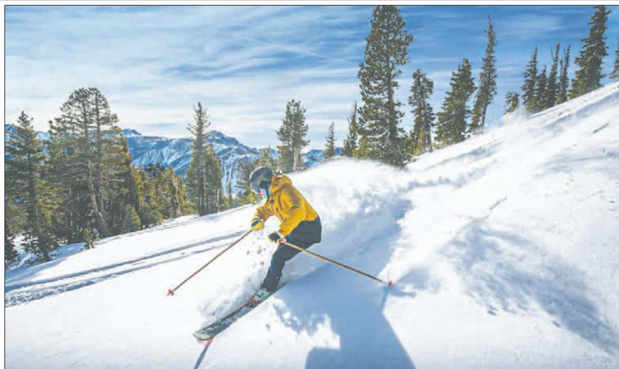
MAMMOTH LAKES, CA - You will find steep trails, great cruisers and everything in between at Mammoth Mountain in California. With a direct flight via United Airlines from Denver (DEN) to Bishop, Calif., (BIH), which is a short distance to Mammoth Lakes, you can easily get to this Unreal ski destination from major U.S. hub airports. Mammoth received more than 700 inches of snow in the 2023-24 winter season which lasted until August 6th. Powder days as well as cruising days were plentiful.

Did we mention that the mountain got over 300 inches more snow than average in 2022-23? Add in Mammoth Lakes' average of 275 days of sunshine per year and that equals an unreal alpine destination. Where else can you barrel down a powder-soft mountain while the California sun