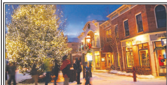
Breckenridge, CO - Peak Property has all the best places to stay for skiing and for town events like the "Lighting of Breckenridge" pictured above.

BRECKENRIDGE, CO – If you had the opportunity, would you call a friend that knew all about your next vacation destination?