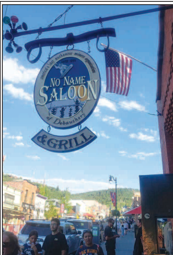
PARK CITY, UT - On the left, a beautiful July day on Main Street as visitors pass under the No Name Saloon sign. In any season, No Name is ready to welcome you to their unofficial museum. Among the memorabilia, you will be greeted by John Wayne and Elvis posters. If you look up you may even see a motorcycle hung from the ceiling. Trinkets large and small will keep you amused while you enjoy a Buffalo Burger and beverage.

Take a walk through the main bar, and take the stairs on your right leading up to The Loft and Mezzanine. Keep going up the stairs and you will land in the Mezzanine, a cozy little bar that also services the Rooftop. This is a great little place to hangout and chat with